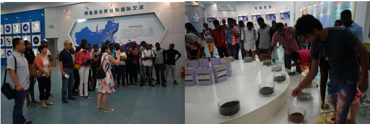
Internship and Visiting the Shandong Kaitai Co.,Ltd., a world leading company featuring metal surface polishing technology.

The ability to put theory into practice is highly valued by employers in today's competitive job market. In response to that, SDJTU put an emphasis on application oriented teaching method. What's more, its connections with government bodies and renown multinational corporations enable it to provide plenty of social practice opportunities and internship for overseas students so as to enhance their employability and transferable skills, such as communication, adaptability and even language skills. All of these factors account for its outstanding employment rate among over 300,0 universities in China. Last year, statistics show that the average salary of SDJTU graduates reaches 3000 usd per month.