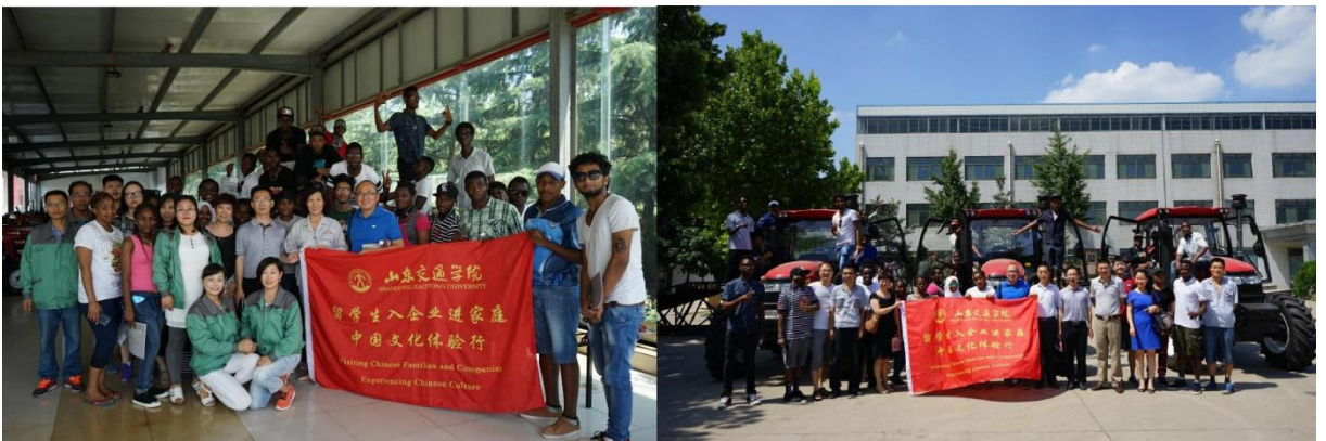
Group photo of Shandong Jiaotong University students participating in factory Internship&visiting