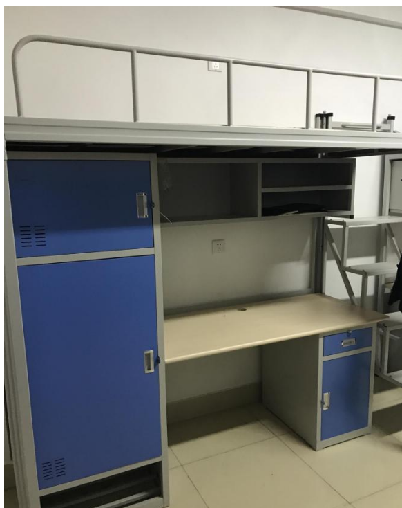
Four Person Room