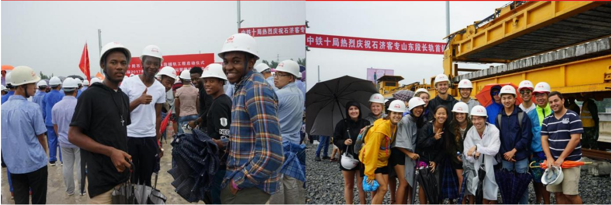
Internship and Attending the opening ceremony of speed train project, China's national project