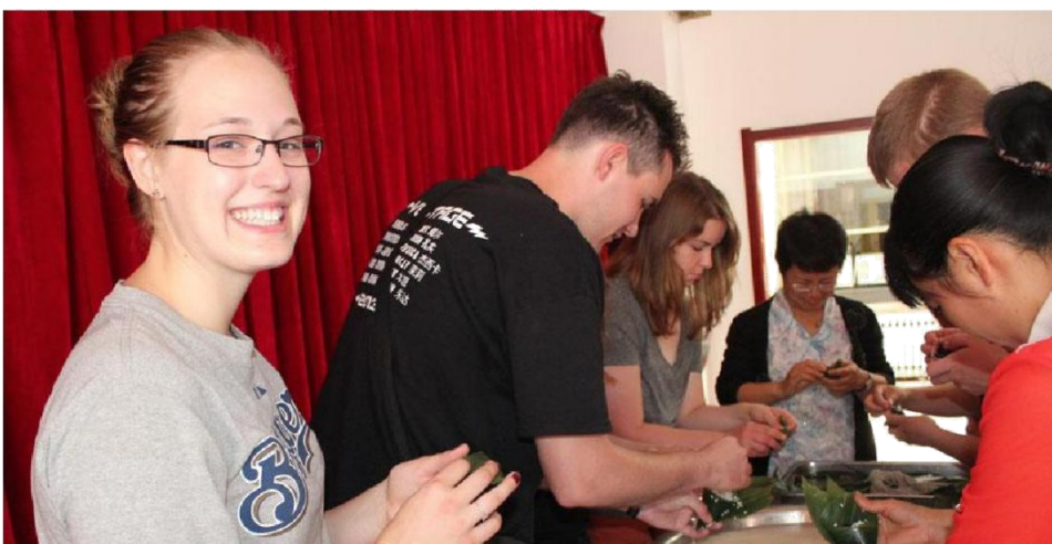
Making rice dumplings, a typical food on Dragon Boat Festival

A welcoming campus, colorful extracurricular activities, and a solid support structure to ensure you'll quickly feel at home.