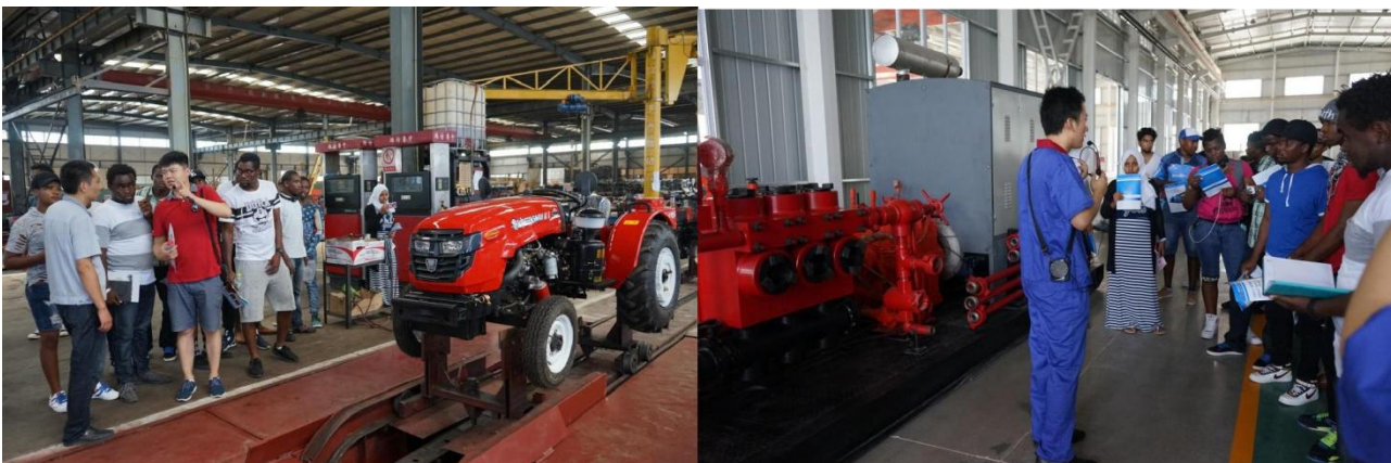
Assembling workshop of Luzhong Tractor Co., Ltd, a renowned automobile company.