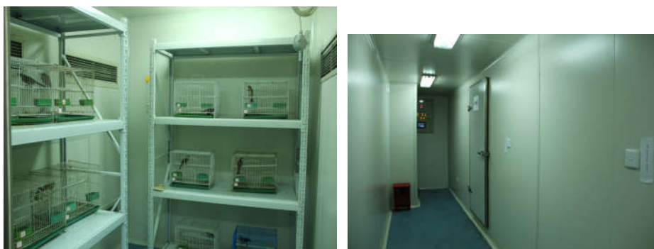
animal experimental and nurturing platform