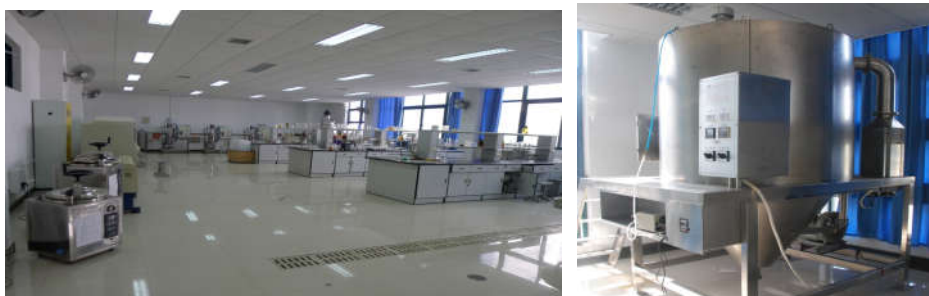
fermentation engineering experimental platform