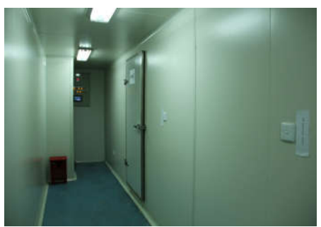
animal experimental and nurturing platform