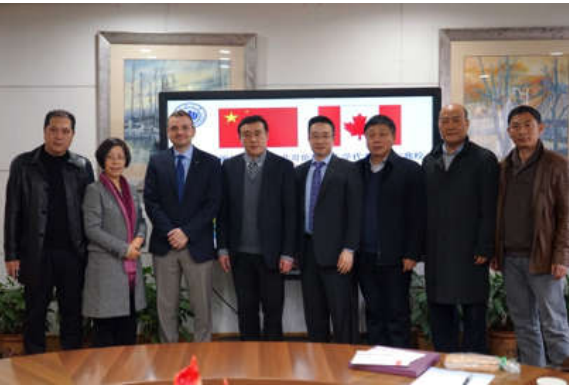
University of Northern British Columbia