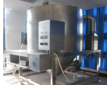
fermentation engineering experimental platform